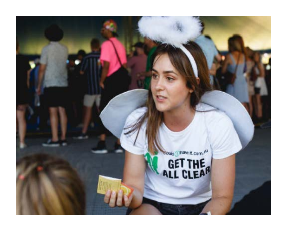
Image 2: Peer educator handing out CIHI branded condoms at the Falls Festival onsite STI testing facility

Revellers at Falls Festival are being rewarded with free condoms, water, mints, cologne/perfume, glitter and use of superior toilet cubicles for taking part in STI tests.