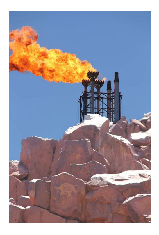
Woodside gas flare, Burrup Peninsula, 2 August 2018