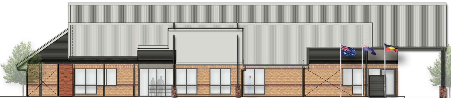
Artist's impression of the front of the new Pingelly Health Centre.

The Pingelly Health Centre will also provide 24/7 emergency care, including via the Emergency Telehealth Service during operating hours. Construction on the new Pingelly Health Centre is due to commence in the second half of 2016.