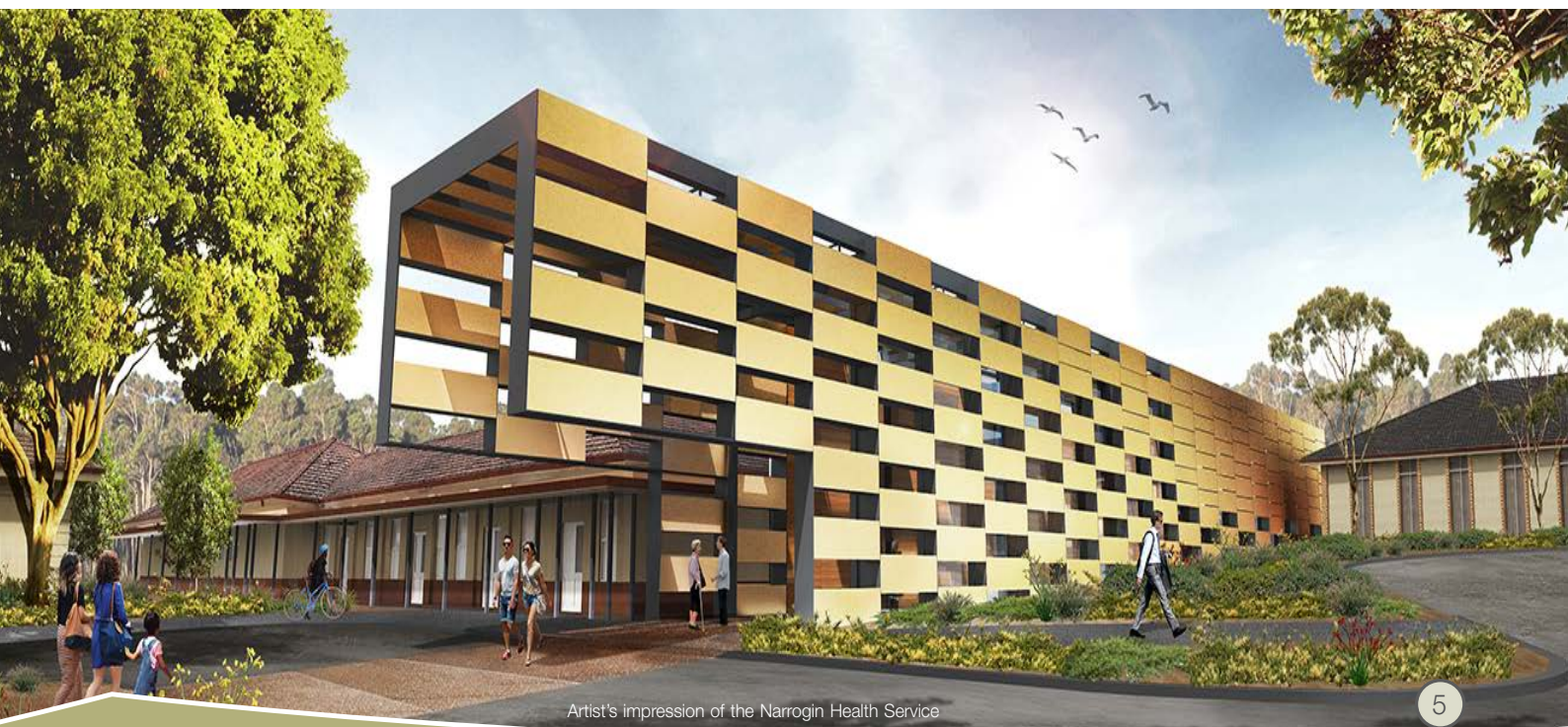
Artist's impression of the Narrogin Health Service