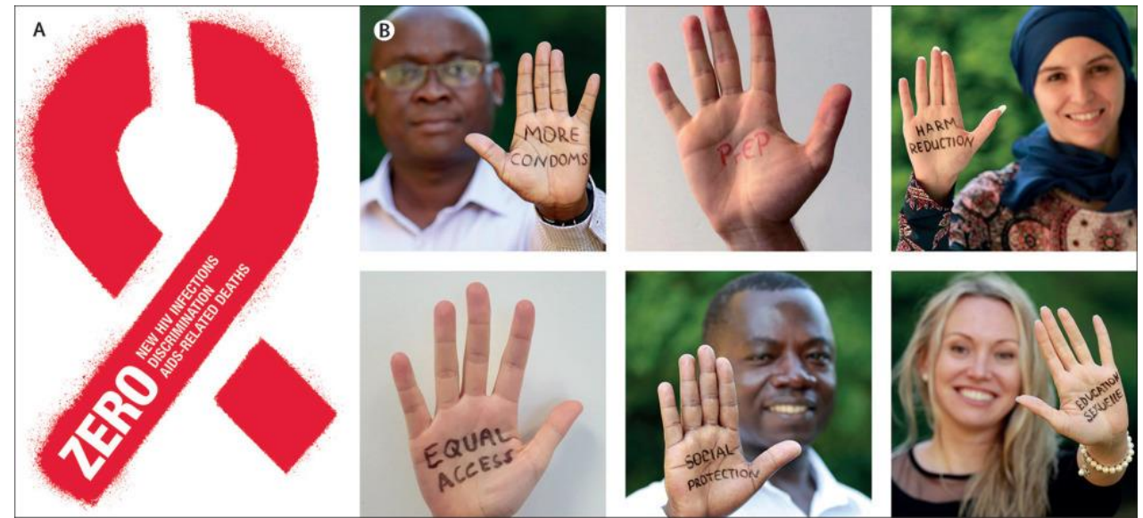
World Aids Day 2016 Hands up for HIV prevention (global messaging)