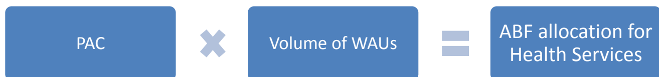
FIGURE 2: ABF FUNDING ALLOCATION FOR HEALTH SERVICES

Refer to the WA Health Funding and Policy Guidelines 2014-15 for further information.